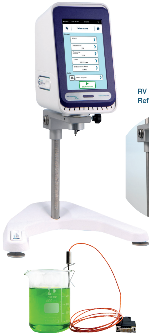
RV SPRING GuardLeg Ref. 100686